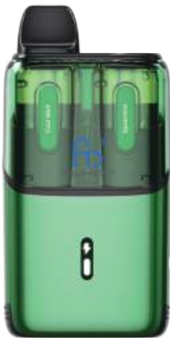
Fumot Ultra T32000

@fumot_official @Fumot_Official www.szfumot.com FUMOT Made in China