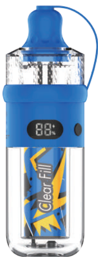
Fumot Clear Fill